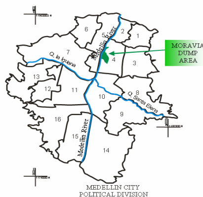
Figure 1. Localization of the Moravia dump in Medellín, Colombia.

Site description. The Moravia dump (6° 13' N, 75° 34' W) is situated approximately 40 m from the Medellín river margin (Figure 1) and operated from 1970 to 1984, receiving about of 100 ton/day of industrial, domestic and medical residues (Integral, 2000). This area became progressively inhabited and by the end of 1983 more than 17.000 people were living there, with 1.013 families still residing there today.