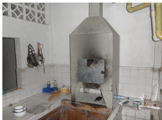
Figure 10b. Retort