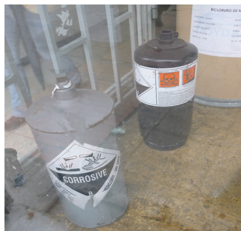
Figure 1b. Quimicos Campota Almaden (black) EEUU (gray)