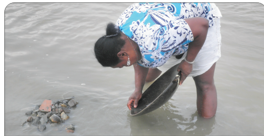
Figure 7. Quibdo gold panning w/o mercury

Quibdó, Dept. Chocó–Quibdó, the capital of Dept. Chocó, is approximately 1 hour by air, west-northwest of Bogotá. Chocó is known for its biodiversity and for its long history of small- and medium-scale gold-platinum mining. The gold-bearing, Río Atrato forms a backdrop to the city (figure 7). Pre-contact platinum artifacts in museum collections indicate that ancient Colombian miners and craftsmen, using blowpipe technology, achieved temperatures sufficiently high to smelt platinum (1764°C; Petersen 1970/2010)—a technology not used in Europe until the late 1800s (Bergsøe 1937; McDonald 1960; Scott & Bray 1980; Bray 1988).