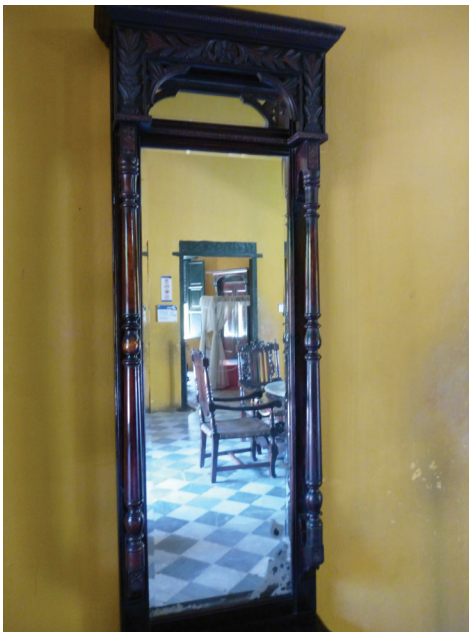
Figure 14. Antique mirror with mercury...Quinta de San Pedro Alejandrino

Paint—Until about 1990, mercury-containing paint was used to control mold and mildew in the U.S. (Brooks & Matos 2005). A site visit to Home Center, a major home supply center in Bogotá, indicated that Pintuco (Compañía Global de Pinturas S.A.) provides a household paint with an anti-mold, anti-mildew ingredient and mercury-based anti-mold, anti-mildew paints are not used.