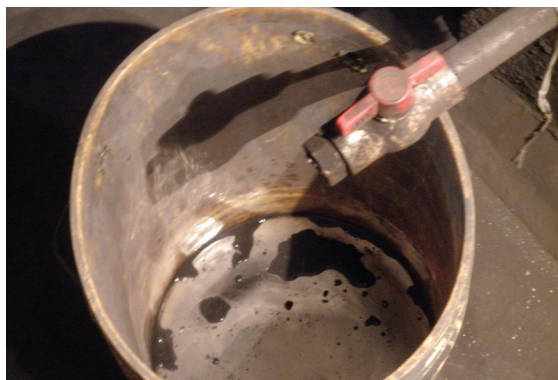
Figure 15. Almaden mercury Mexico

The metal sludge then goes into one of six 2m x 30cm half-cylinder containers which are placed horizontally into the retorts. The retorts are sealed and heated to 480°C for ~24 hours, with no one present during retorting. The Hg vapor moves through a tube, condenses, drops into a water-filled tank behind the retort room wall and then the reclaimed Spanish colonial mercury, originally from Almaden, can be tapped and cleaned for sale (figure 15). Gas is used to fire the retorts and retorting takes place over the weekend in the ventilated retort room.