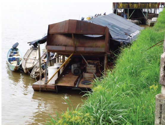
Figure 9. Rio Atrato draga