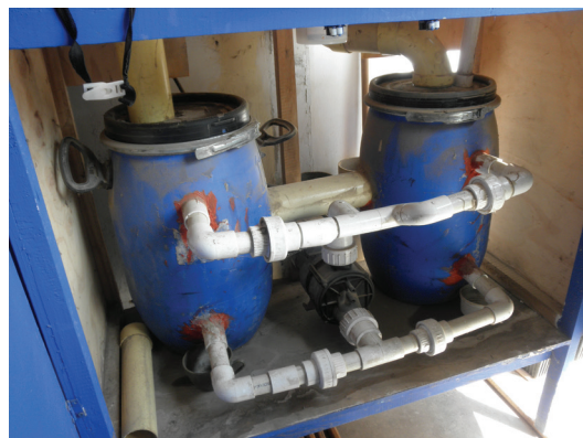
Figure 10c. Water tanks