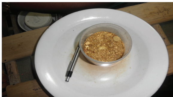
Figure 5. Green gold

In one “green gold” method, the gold-black sand concentrate is first dried and the magnetite is removed with a magnet. The concentrate is then placed on an inclined pan or saucer, is gently tapped to cause any remaining magnetite grains to fall away leaving a gold concentrate; however, this “green gold” gold may also contain mercury (575 ppm Hg; table 3). Typically, the alluvial gold produced by non-mercury methods can be easily recognized—the grains are individual, mm-sized, and somewhat flattened-rounded (figure 5).