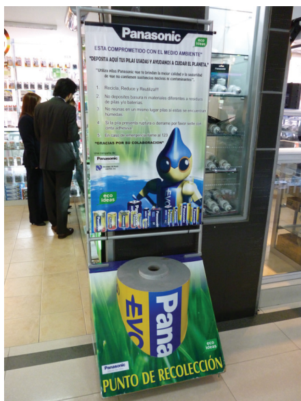
Figure 11. Bogota Panasonic recycling.

Button batteries used for calculators, watches, and other uses may come from China and Indonesia and are routinely sold in multi-battery packs in stores near Calle 21 and Carrera 9 in Bogotá. Some of the packages indicate that lead and mercury are used in the battery and that the battery should not be disposed of in the trash. Some used batteries may reach a collection bin (figure 11), but whether or not the mercury from the used batteries is recycled is unknown.