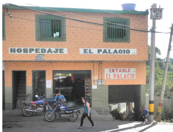
Figure 6. Remedios entable hospedaje above

In Colombia, gold ore may also be treated in ball-mills in shops known as entables (figure 6); mercury is added to the sediments in the ball-mill, the mixture is tumbled, and then the amalgam is removed and burned to volatilize the mercury and recover the gold. This final burning (called refogado only in Perú) helps the gold dealer gauge the purity of the gold, set a price and, most importantly, the gold is always visible to the dealer and to the miner. The doré from the gold shop in Remedios, Dept. Antioquia, for example, is then taken to Medellín (C.I. Fundación Escobar S.A., Calle 33 no. 43-78) for further refining and parting of the gold and silver.