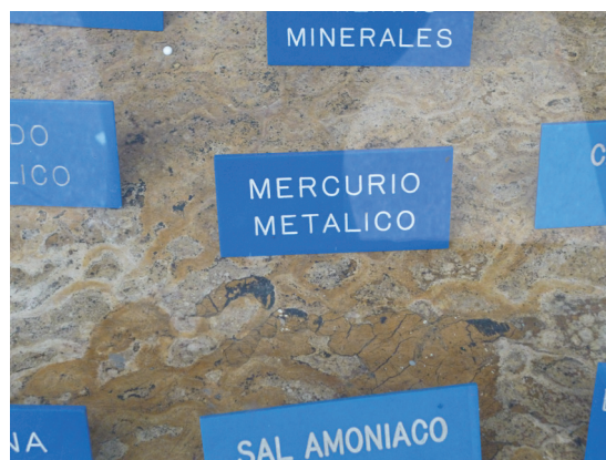
Figure 1a. Quimicos Campota mercury for sale

Mercury-cell technology is used by Brinsa S.A. (Dept. Cundinamarca, Colombia) to produce salt, cleansers, chlorine, and caustic soda; however, the amount of mercury in the cells, or stocks on hand, was not available. An unknown amount of mercury was also on hand at dental supply shops, dentists’ offices, laboratories, museums, neon lighting shops, and importers in Colombia (figure 1).