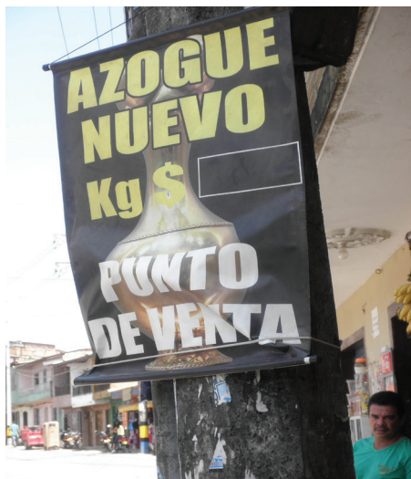
Figure 4. Remedios mercury for sale

In 2006, the price of gold was US$600 per troy ounce (Kitco 2006); however, by February 2012 the price of gold was above US$1,700 per ounce (Kitco 2012). The increased mercury price, from 2006-2011, has largely been driven by: 1) the increased gold price, 2) a diminishing supply of mercury from traditional sources (Brooks & Matos 2005), and 3) European and impending U.S. mercury export bans. Average mercury and gold prices for 2006-2011 are compiled on table 4.