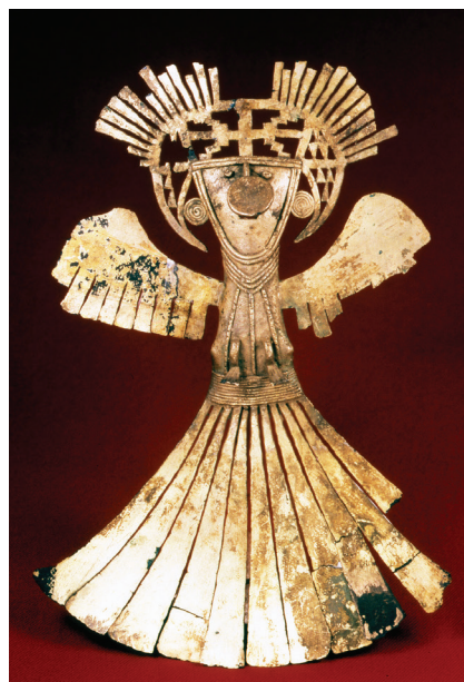
Figure 3. Copper-gold pendant (3.038 Museo del Oro, Bogota)

Many gold funeral masks from Perú are decorated with cinnabar (Carcedo Muro & Shimada 1985); however, no cinnabar is present on the many gold funeral masks, or other gold artifacts, on display at the Museos del Oro in Bogotá, Cartagena, or Santa Marta. Perhaps cinnabar simply was not widely used in ancient Colombia? Or if used, perhaps the cinnabar was removed during preparation? A photograph of a winged pre-contact copper-gold figure from the Museo del Oro, Bogotá, shows reddish stains and splotches that may be cinnabar (figure 3; Plazas & Falchetti 1985, p. 53).