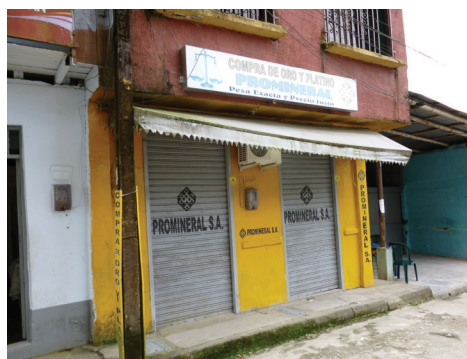
Figure 10a. Quibdo gold-platinum shop

dealer had approximately 1 kg of gold (figure 5) and 1.5 kg of platinum on hand.