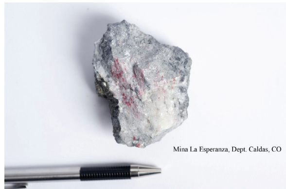
Figure 2b. Mina La Esperanza quartz vein with cinnabar