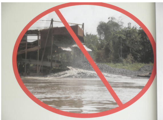
Figure 8. Quibdo responsible mining