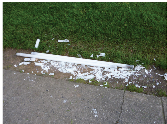
Figure 13b. Broken lamp