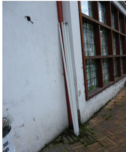
Figure 13a. Univ Nacional eight foot fluorescent

is the active ingredient in some skin-bleaching creams (Marzulli & Brown 1972) and these skin-lightening creams have been used in many parts of the world in order to obtain a lighter skin-tone by inhibition of pigment formation. These preparations have been widely sold in parts of Asia, the Middle East, and also in Mexico. For example, health officials in Texas (U.S.) have warned of a mercury-laden face cream available in Mexico that is sold online, and thus far, 20 people have tested positive for elevated levels of mercury (Allford 2011). For example, see: Piel Mas Blanca (Lighter Skin) http://pielmasblanca.com/?hop=dgoogle (accessed September 7, 2011). In a research report, Al-Saleh & Al-Doush (1997) provide the names, mercury content, and country of origin of more than 30 skin-lightening creams used mainly in the Middle East; one sample from Lebanon contained 5650 ppm mercury. At present, there is no data on imports or use of these creams in Colombia.