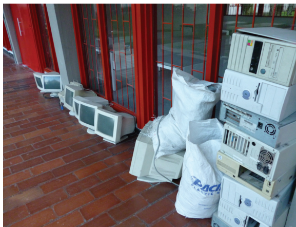
Figure 12. Univ Nacional computers

Thus far, there is no recycling of computers in Colombia (figure 12). For security reasons, used U.S. Embassy computers are destroyed and the metals, including gold in the hard-drives, are not recycled. Used computers and electronics may be passed from one agency to local schools or refurbished and resold in Bogotá and some used computers may also be resold so that the gold contained in the microprocessors may be recovered.