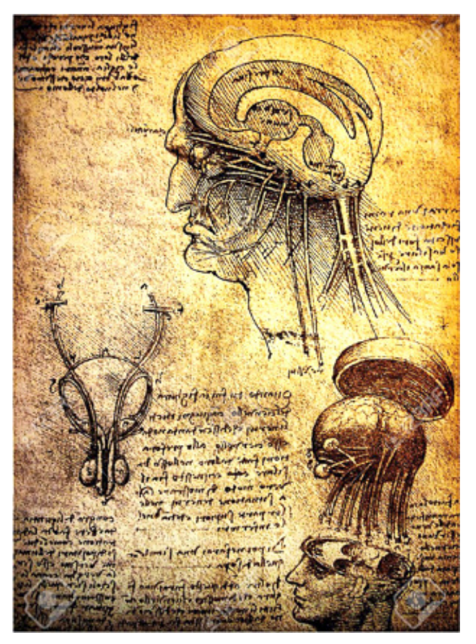
Figure 2. The four encephalic ventricles at the top. Leonardo da Vinci's drawing. Source: (22).

Furthermore, the great anatomist Andreas Vesalius (1514-1564), contemporary of Leonardo, came to conclusions that contradicted established galenic dogmas by means of dissections made in executed criminals. For example, he noted that the structure of the brain was different from that of Galen, and that the brain ventricles did not contain any spiritu , but were filled with a clear fluid, later called cerebrospinal fluid (CSF). References of this clear fluid inside the skull had already been made in the past; in a papyrus dating from the seventeenth century BC, a skull fracture is described in the occipital region with a fluid leak (23).