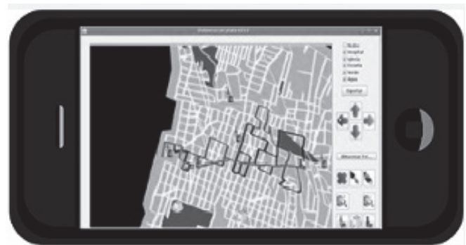
Figure 3. Driver using our Intelligent CVRP to Ciudad Juarez.

Since a user could move from one computing environment to another, ubiquitous computing poses a number of challenges in designing software architecture. Thus, to design user interfaces for mobile devices should take into account a number of constraints. Indeed the limited screen is to show the information. Since there is nowadays a wide range of screen sizes and resolutions, an interface